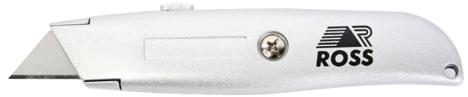
F7270 TK2 - Trimming knife - Retractable blade