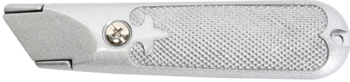
F7749TK1 - Trimming knife - Fixed blade