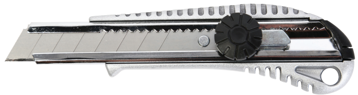
F4001 TK5 - Knife - Snap-off aluminium body- 18mm