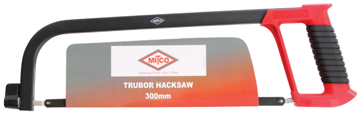
FMHS1 - 300mm Trubor hacksaw