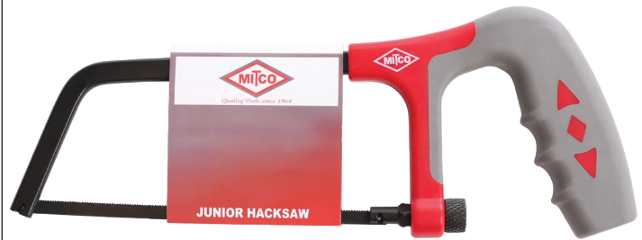
FMHS3 - Junior Hacksaw