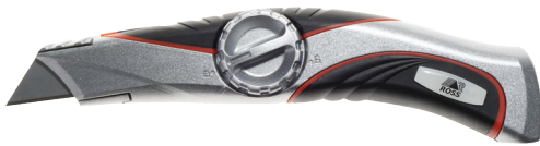
F4006 TK9 - Heavy Duty Knife