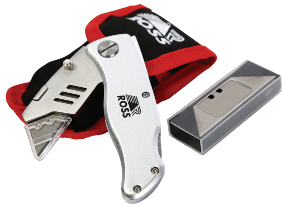
F4000 TK4 - Folding utility knife and pouch