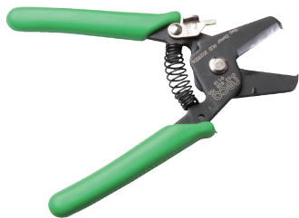
PIN.008 Cutter for Nylon Cable Ties Size: 145mm Pack size: 1 Tie Width: 2.5 ~ 12.5 Material: Nylon 6.6