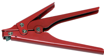
HS-519 Tensioner for Nylon Cable Ties Size: 195mm Pack Size: 1 Tie Width: 2.5 ~ 9 Material: Nylon 6.6