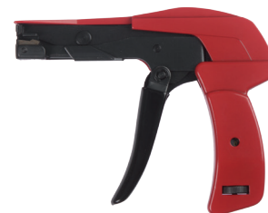
HS-600A Tensioner for Nylon Cable Ties Size: 165mm Pack Size: 1 Tie Width: 2.3 ~ 5 Material: Nylon 6.6