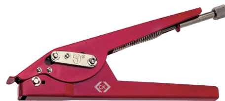
D92137 Tensioner for Nylon Cable Ties Size: 145mm Pack size: 1 Tie Width: 2.5 ~ 12.5 Material: Nylon 6.6